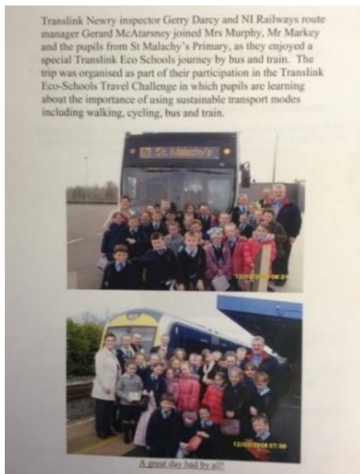
First Year Participation of St Malachy's Primary School