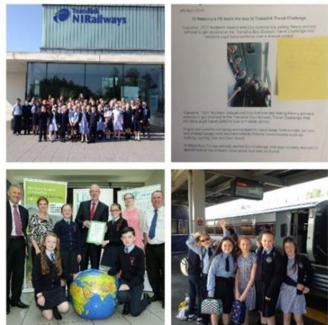
A collage of years of St Malachy's Travel Challenge