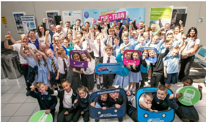
Eco-Schools celebrate Travel Challenge success at Central Station.

Lagan College, Belfast; Ballymacricket Primary, Crumlin; Mill Strand Integrated Primary, Portrush; and Cranmore Integrated Primary, Belfast, were the top performers encouraging pupils and parents to use more environmentally-friendly transport.