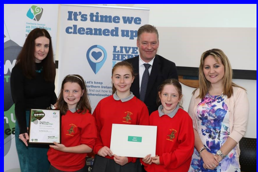
St Patrick's Primary School, Burrenreagh

As a thank you, a number of schools and groups who provided a record of their work were entered into a rewards scheme and were presented with awards and prizes on the day.