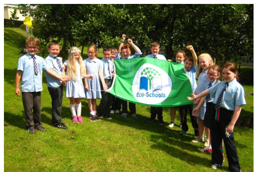
St Columba's Primary, Kilrea

Have a brilliant summer!! We'll see you in September.