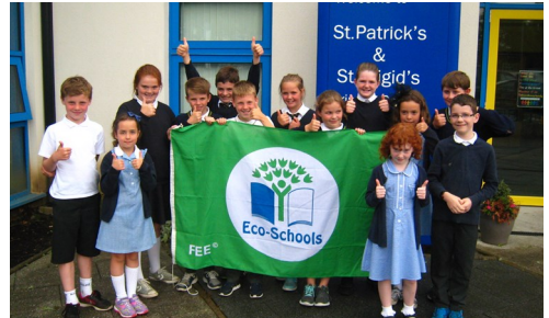
St Patrick's and St Brigid's Primary, Ballycastle