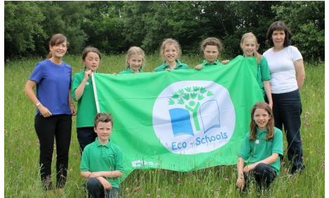
Killyhammon Primary, Enniskillen