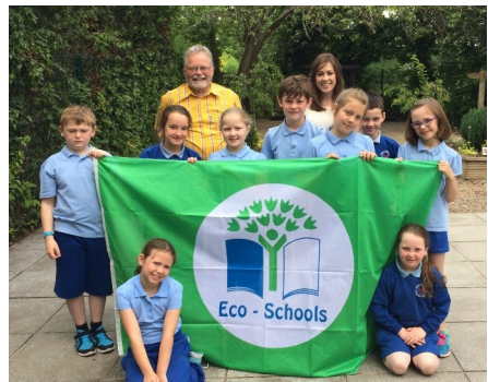
Mullavilly Primary, Portadown