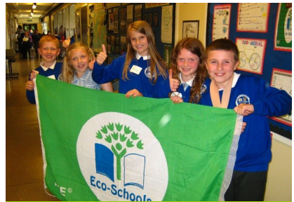
Crumlin Integrated Primary, Crumlin.