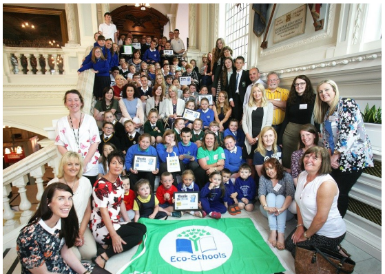
Belfast Eco-Schools celebrate at Belfast City Hall.